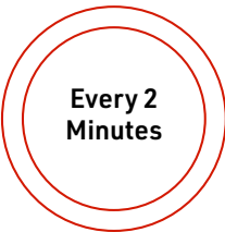
Beginning of 2016