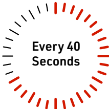
End of 2016