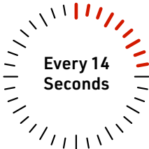
End of 2019